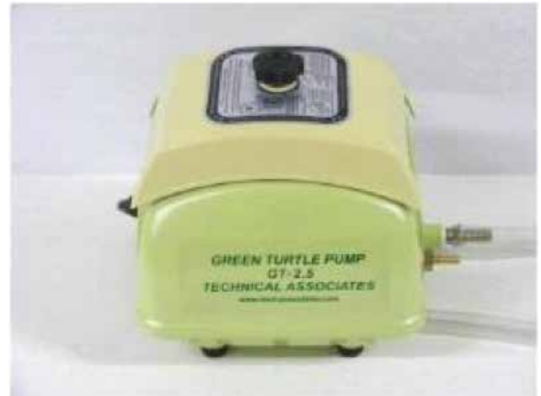
Oil-Less Green Turtle Pump