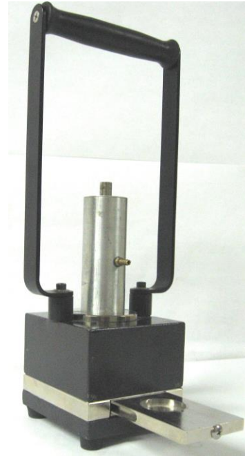
SF-TF6 – SPEEDY FERET