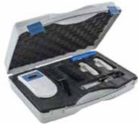
FX Carrying Case