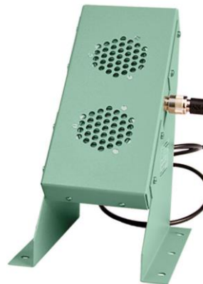
SHOE DETECTOR (2) T-1190 SENSORS