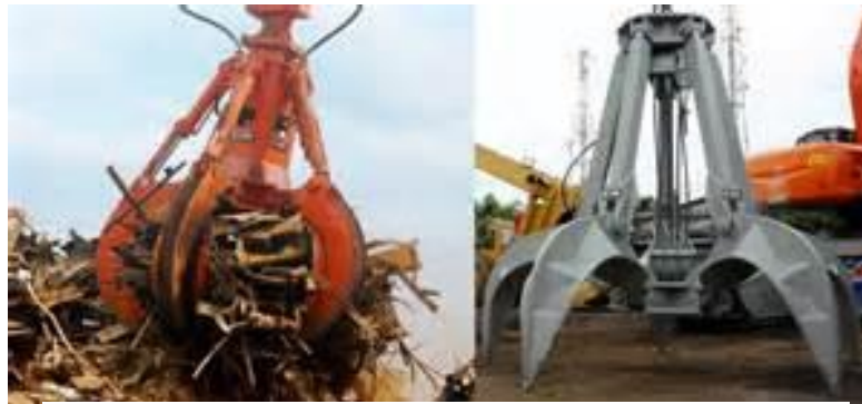
DETECT & REJECT CONTAMINATED SCRAP METAL