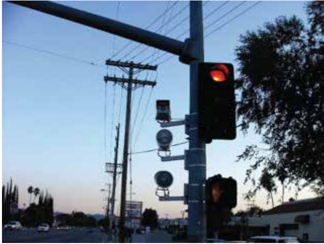
DSI-2NT-ITS Traffic Signal Mount