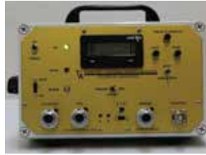
PRS-7 Electronics Bench Top