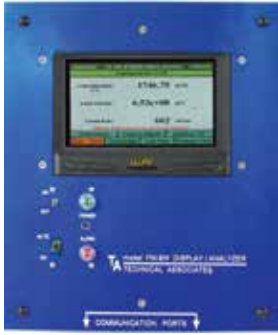
FM-9W Electronics Wall Mount