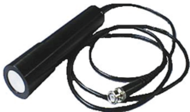
PGS-3 & PGS-3L