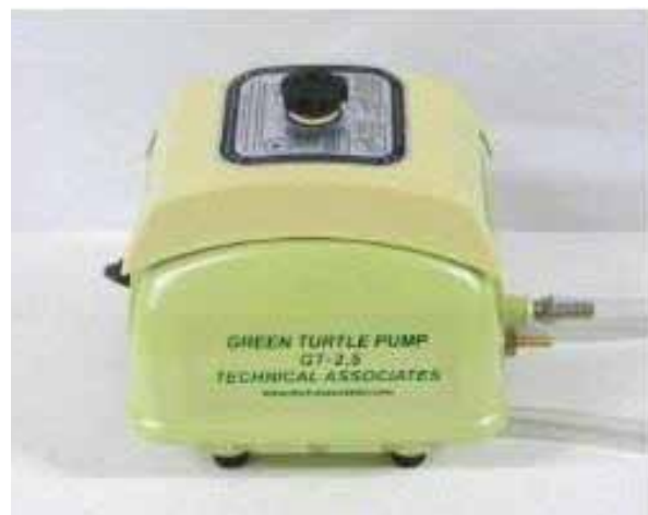
Oil-Less Green Turtle Quiet Pump