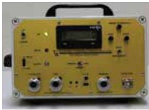
PRS-7 Electronics SSS-12P-1