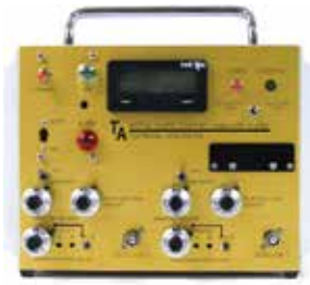
PRS-7-DSC Electronics SSS-22P and LR-