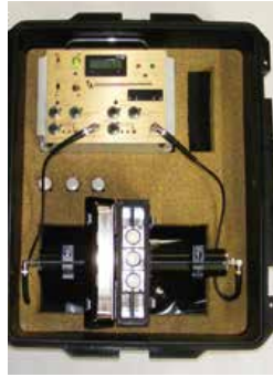
SSS-22PAL Suitcase Version ALL-IN-ONE