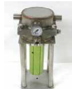
In-Line Radium Detector