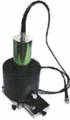
Portable Sample Counter with STAM-2R