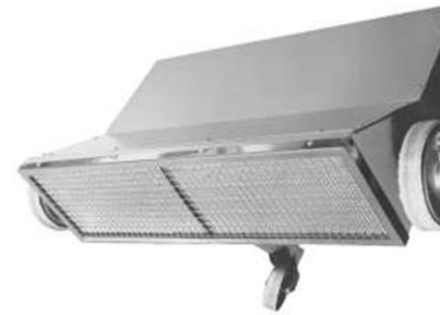
AFBM-SERIES FLOOR MONITORS