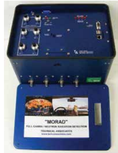
Customized Emergency Response Vehicles with MoRad on Board