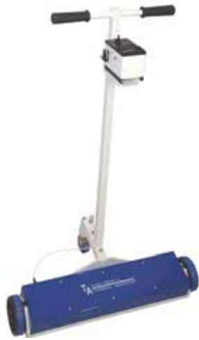
AFBM-Series Floor Monitors