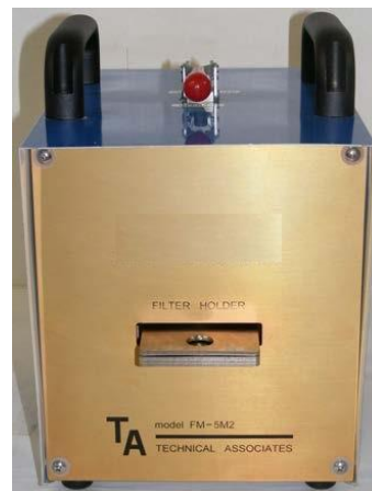
DRAWER SYSTEM WITH 2" SHIELDING