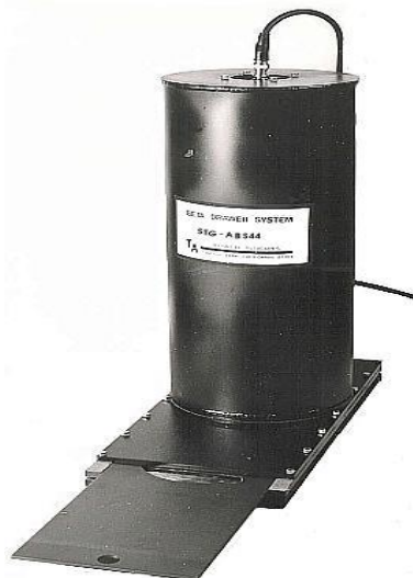
STANDARD DRAWER SYSTEM NO SHIELDING

Alpha / Beta Dual Scintillation Detector: 4" diameter. The 90 cm 2 face of the probe allows shorter count times plus high sensitivity.