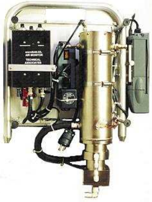
MicroBAM-3ZC Hand Carry.

TA TECHNICAL ASSOCIATES 7051 ETON AVENUE * CANOGA PARK, CA 91303 TELEPHONE (818) 883-7043 * FAX(818) 883-6103