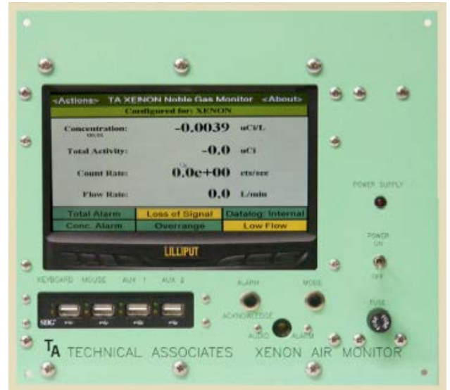
FM-9XE ELECTRONICS FACE PLATE