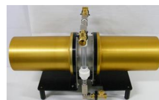
NEX-ABG-9TT DUAL DETECTOR ASSEMBLY