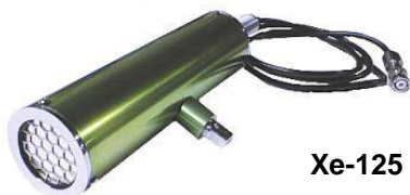
Xe-125 Detector PGS-3X