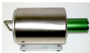
I-125 Detector PGS-3I WITH SHIELDING