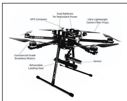
CYPHER 6 UAV by FlyCam UAV