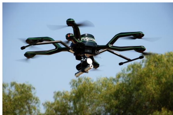
NEO with DroneRAD Detector System